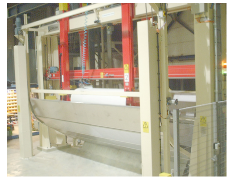
lamella sliding device