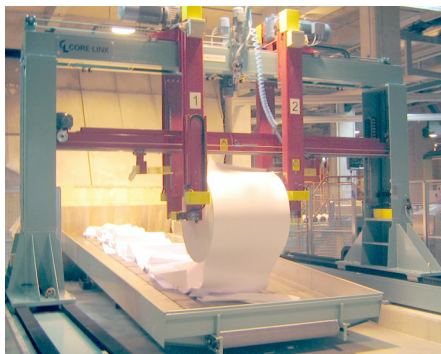
movable, rail system or rails on floor